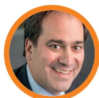
Chad A. Mirkin